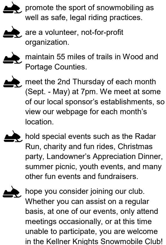
Radar Run 2018