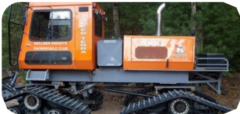
2000 Tucker purchased in 2019

The Kellner Knights Snowmobile Club is based in Wisconsin Rapids, WI and serves Wood and Portage Counties. Founded in 1970, by a small group of avid snowmobilers hoping to improve the sport of snowmobiling by influencing others to ride safe and respect the land they ride on. Our mission is to promote lawful and safe practice of our sport no matter where you ride. We hope our dedication to the sport of snowmobiling influences others to act responsibly and join a snowmobile club.