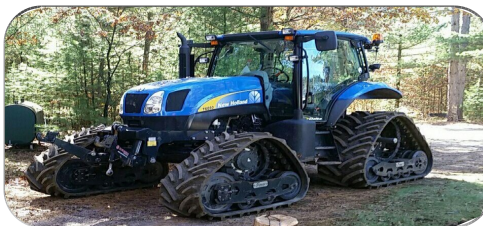
2008 New Holland purchased in 2014